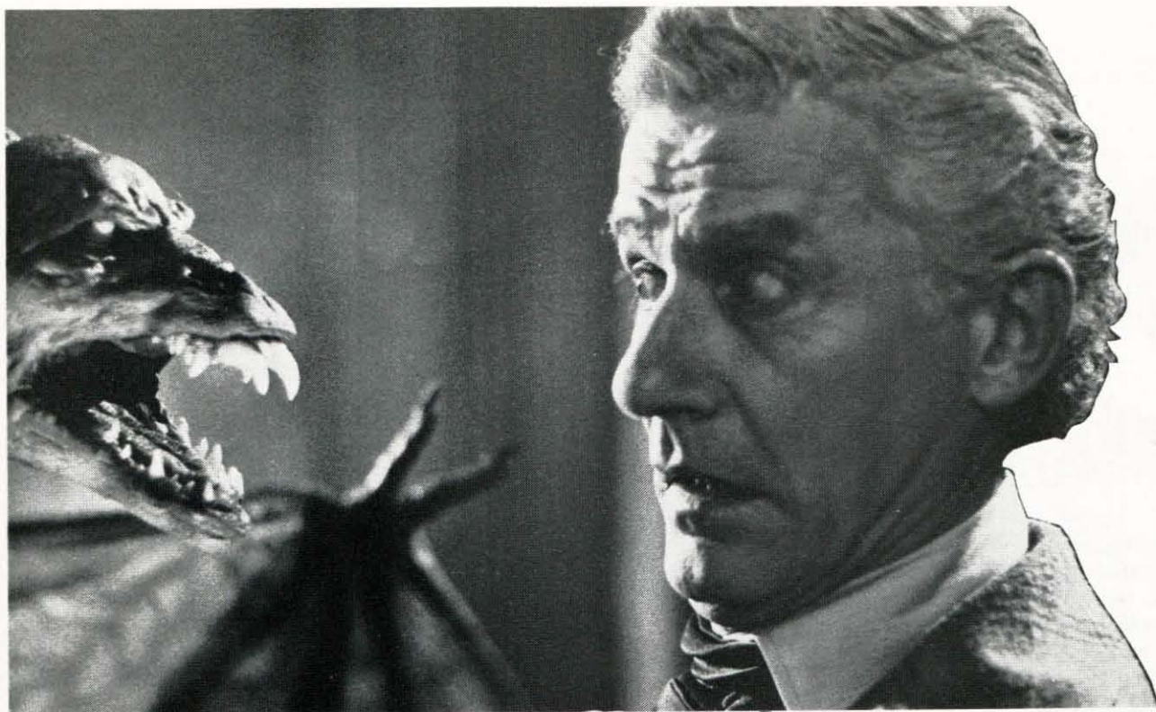
And a Fightful Night was had by all.

Greystoke. I mean, in Greystoke they were ashamed to mention the name Tarzan and they didn't say it once in the film, while in The Hunger they didn't say the word vampire once. I think those guys should go out and make other kinds of movies if they're going to be ashamed of the genre."