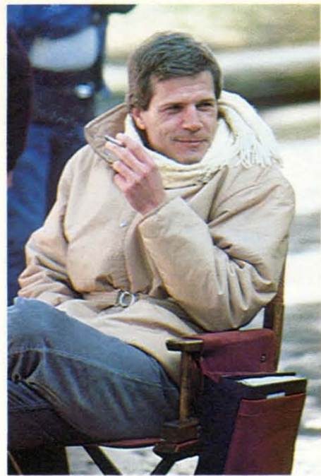
Writer-Director Tom Holland