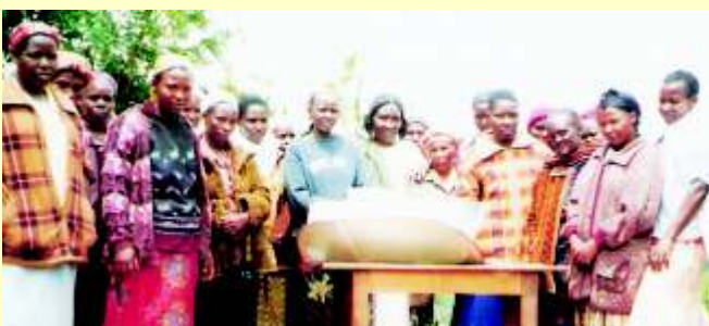
Gaketha Laura Energy Group, Meru.