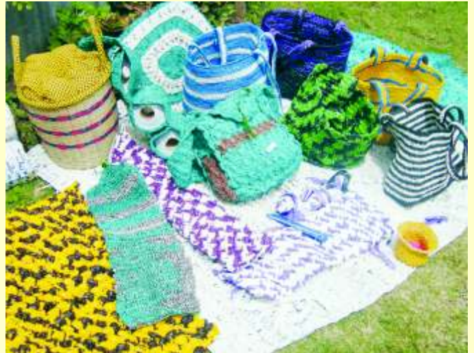
Useful items from recycled plastic bags