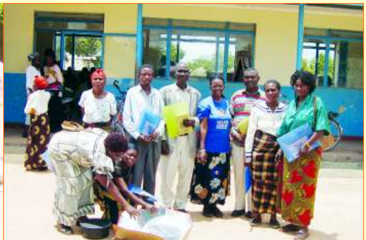
Oh! It's hot !