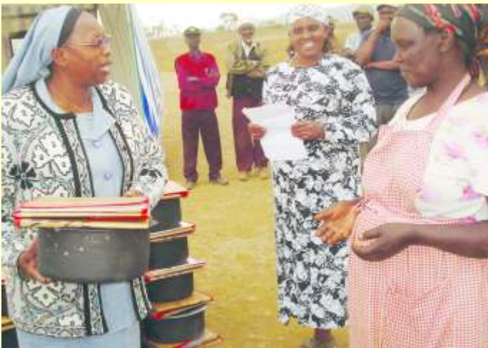
Cookit distribution - Mai Mahiu IDP camp.