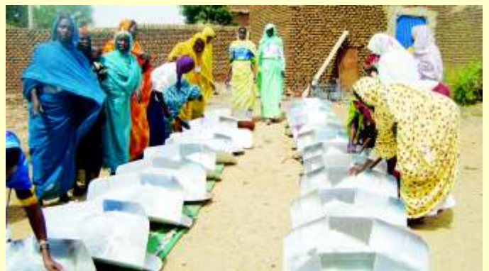
Zalengei trainers - solar cooking.