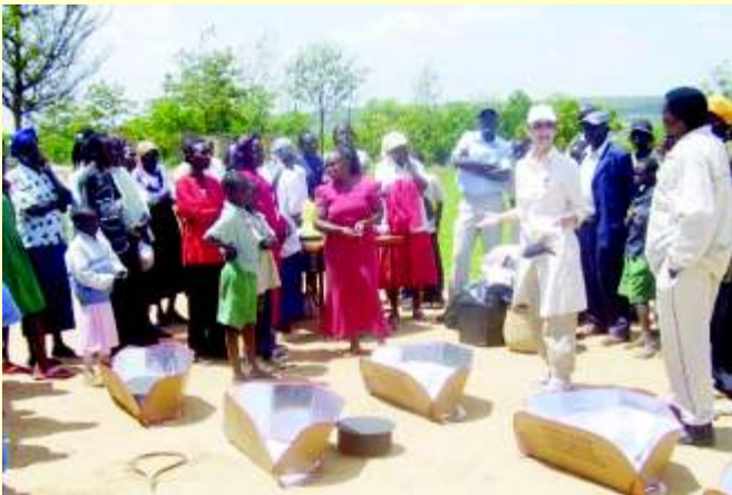
Nikila and Kithua vilagers