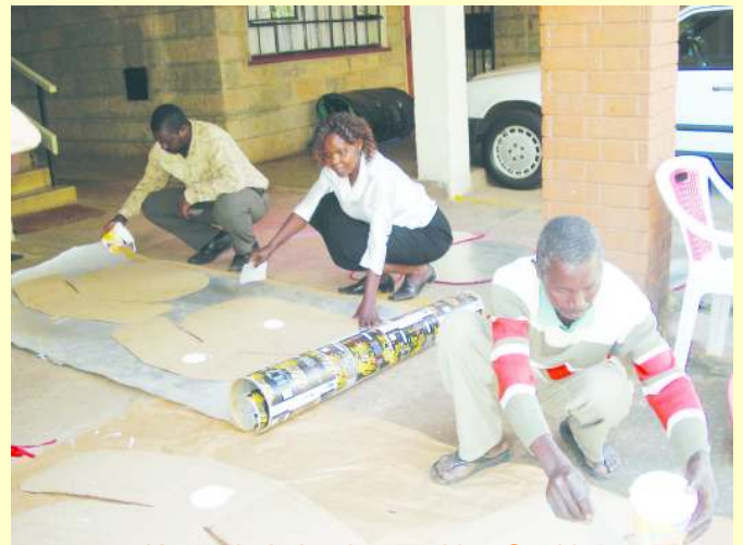
Kamusinde leaders making Cookkits