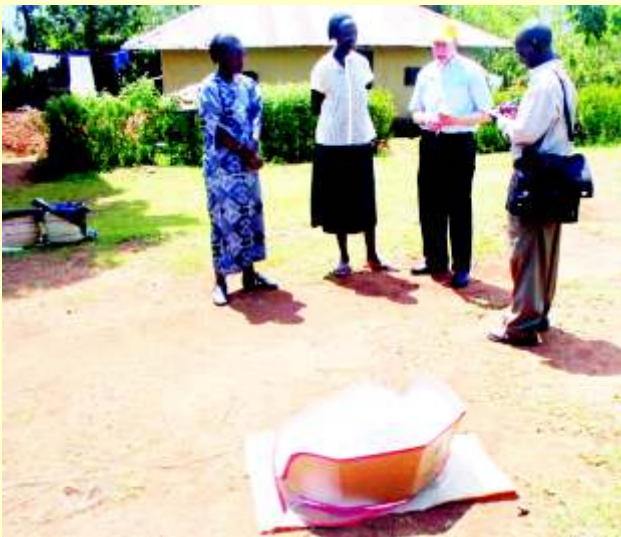
SWP follow up- Western