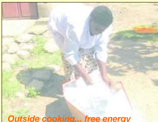
Outside cooking... free energy

USEPA in partnership with Solar Cookers International (EA) and Practical Action, are targeting 3,000 households by the end of 2010.