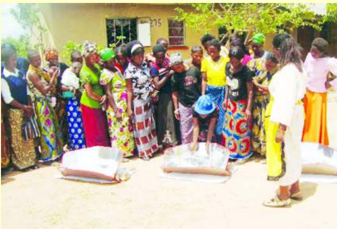
Learning by doing

The following foods were solar cooked; Isima (Ugali) groundnuts, cabbage, rice, meat stew and solar water pasteurization. They also learnt how to use fireless cookers and how to recycle plastic waste materials into useful items.